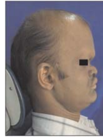
Figure 2 : The profile of patient before treatment shows concavity of face, protuberance of lips & frontal bossing