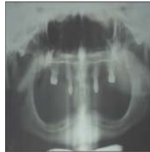
Figure 3: Orthopantomograph shows hypodontia in maxillary arch & anodontia in mandibular arch